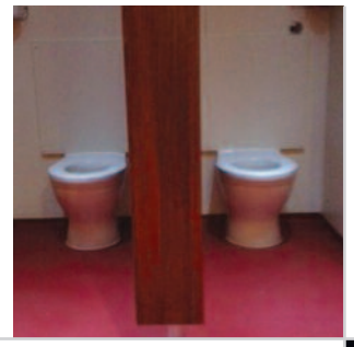
Resan WC pans and Chalmers Nightclubs: A case study in aesthetically pleasing,